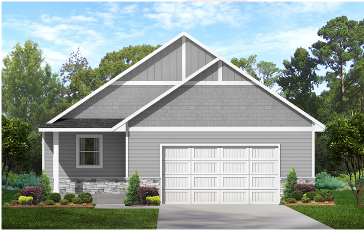
Main Level 1,392 Sq. Ft.